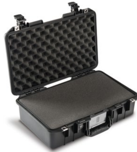
Pick N Pluck™ Foam