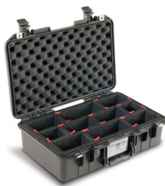
TrekPak™ Dividers (Available in Black Cases Only)